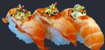
13. Flamberet Laks Nigiri Flambeed Salmon Nigiri