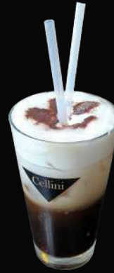
Iskaffe Ice Coffeé 42,-