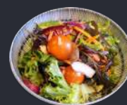
57. Big Salad 40,-