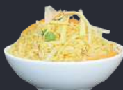
53. Fried Rice