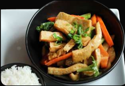
48. Vegetarsteegt Grøntsager m. ris, tofu Fried Vegetables w. rice, tofu 89,-