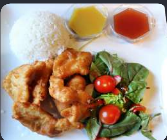
45. Sprød Kylling m. ris, salat, dip Crispy Chicken w. rice, salad, dip 89,-