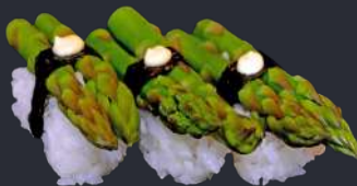
17. Asparges Nigiri Asparagus Nigiri