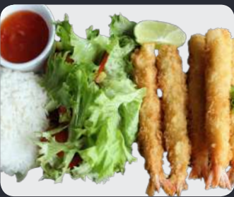
44. Sprød Tigerrejer m. ris, salat og sur-sød sauce Crispy Prawns w. rice, salad and sweet-sour sauce 108,-