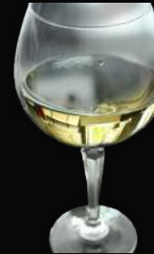
Hvidvin White wine

2016 Codice, Dominio de Eguren, Manchueta, Spanien