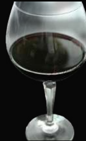
Rødvin Red wine

2016 Codice, Dominio de Eguren, Manchueta, Spanien