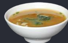
69. Miso Suppe