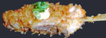
6. Tempuralaks m. chili mayo Tempura Salmon w. chili mayo