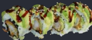
21. Stærk Tempura Rejer (avocado topping) Spicy Tempura Prawns (avocado topping)