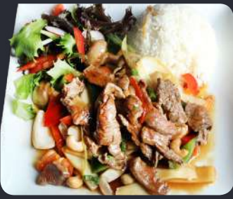
43. Wokstegt Oksekød m. ris, grøntsager Wok fried Beef w. rice, vegetables 89,-