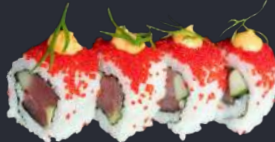
18. Krydret Tun (purløg, chilimayo, avocado, tobikko) Spicy Tuna (chives, chili-mayo, avocado, tobikko)