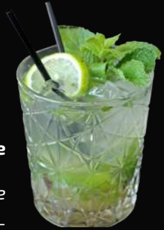
Frisk Lemonade Fresh Lemonade 45,-