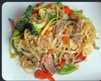
39. Wokstegte Nudler m. oksekød, grøntsager Wok Fried Noodles w. beef, vegetables 89,-