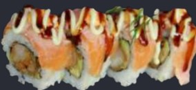
20. Ebi Panko Rulle (laksetopping, agurk) Ebi Panko Roll (w. salmon topping, cucumber)