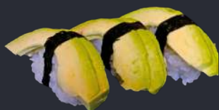
15. Avocado Nigiri