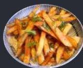
54. French Fries