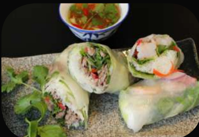
50. Vegetar Sommerruller m. salat, dip Vegetarian Summerrolls w. salad, dip 89,-