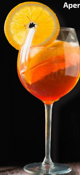
Aperol Spritz 75,-