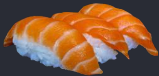
11. Laks Nigiri Salmon Nigiri

Create your own trend dishes for your menu!