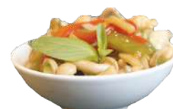
Kung Pao Chicken w. Fired Noodles