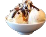
Vaniljeis w. Crumble