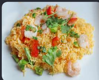
40. Stegte Ris m. kinarejer, grøntsager Fried Rice w. prawns, vegetables 89,-