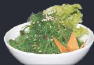
65. Seaweed Salad