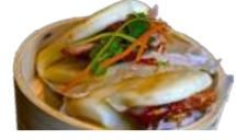
Peking Duck Bao