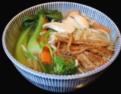
46. Vegetar Nuddelsuppe Vegetarian Noodles Soup 79,-