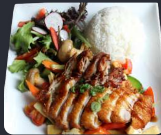
41. Peking And m. hoisin sauce, ris Peking Duck w. Hoisin sauce, rice 109,-