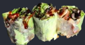
16. Peking Hoisin Duck In Ricepaper