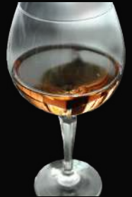
Rosévin Rosé wine

2018 d A Marsanne, Domaine Astruc, Languedoc - Roussillon, Frankrig