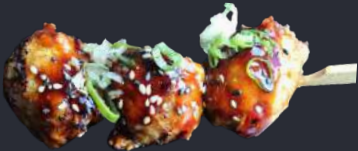
2. Kyllingekød boller m. teriyaki sauce Chicken meatballs w. teriyaki sauce