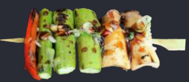
9. Svampe & Asperges m. teriyaki sauce Mushroom and asparagus w. teriyaki sauce