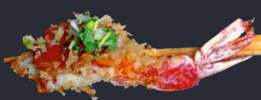
7. Hot & Spicy Reje Hot & Spicy Prawn