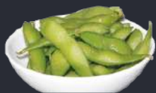
66. Edamame Beans