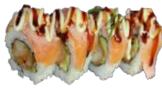
Ebi Panko Rolls w. salmon topping