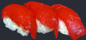
12. Tun Nigiri Tuna Nigiri