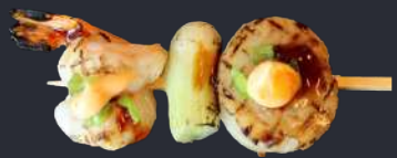
3. Grillet Kammusling m. tigerrejer og chili mayo Grilled Scallop w. prawn and chili mayo