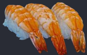
14. Tigerrejer Nigiri Prawn Nigiri