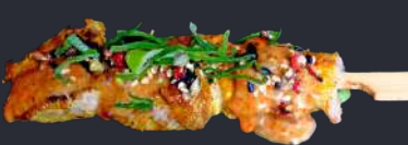
5. Kyllingespyd m. teriyaki sauce Chicken stick w. teriyaki sauce