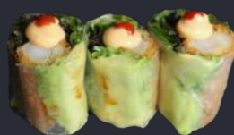
22. Tigerrejer I Rispaper Prawn In Ricepaper