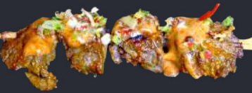
4. Lammespyd m. urtemayo Lambstick w. herb mayo