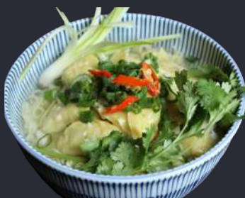
38. Nuddelsuppe m. wontons, forårsløg (seafood) Noodle Soup w. wontons, spring onion (seafood) 89,-