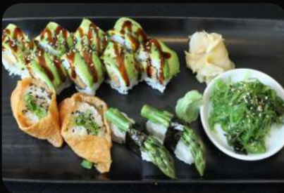
49. Vegetar Mix Sushi 8 pcs. Green rulls 2 pcs. Green asparagus 2 pcs. Tofu 1 pcs. Seaweed Salad 110,-