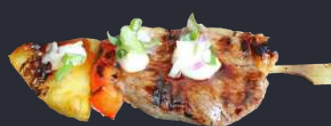
10. Andebryst og ananas m. hoisin sauce Duck breast and pineapple w. hoisin sauce