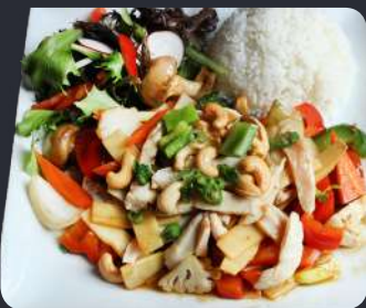
42. Cashew Kylling m. ris, grøntsager Cashew Chicken w. rice, grøntsager 89,-