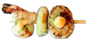
Grilled Scallop Prawn w. Teriyaki dip