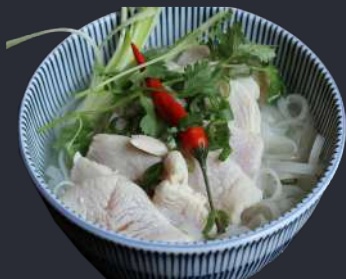
37. Risnuddelsuppe m. kylling, forårsløg Rice Noodle Soup w. chicken, spring onion 89,-