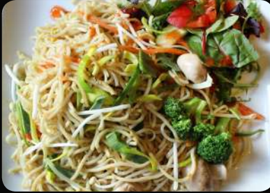
47. Vegetarstegte Nudler m. grøntsager Vegetarian Fried Noodles w. vegetables 79,-