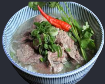
36. Risnuddelsuppe m. oksekød, forårsløg Rice Noodle Soup w. beef, spring onion 89,-