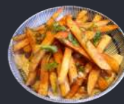
56. Big French Fries 40,-